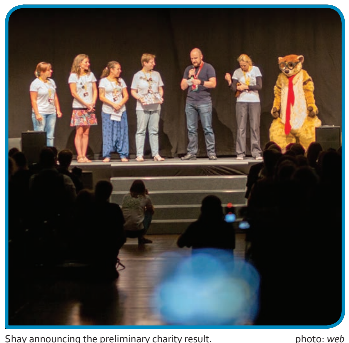
Shay announcing the preliminary charity result.

The closing ceremony L this year was a refreshingly short and simple affair. It consisted mostly of the announcement of the charity preliminary result of €20329.70, and Cheetah's declaration that we had 200 more attendees than yesteryear, coming to a total number of 2798 checked-