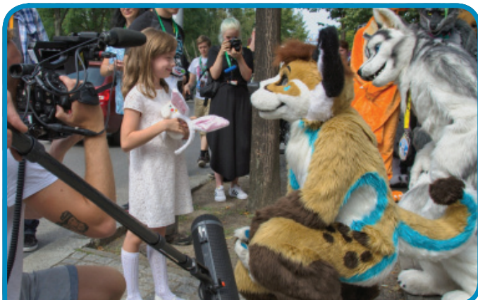
Do it! Boop the snoot gurl!