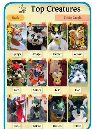
Part of the Leaderboard.