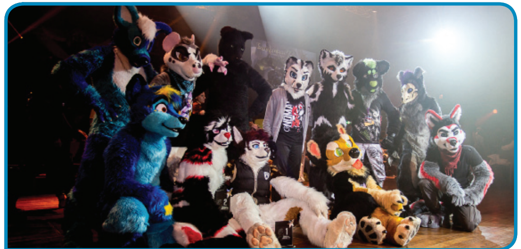
Besides the dance contest, money was raised for the charity in a special auction.