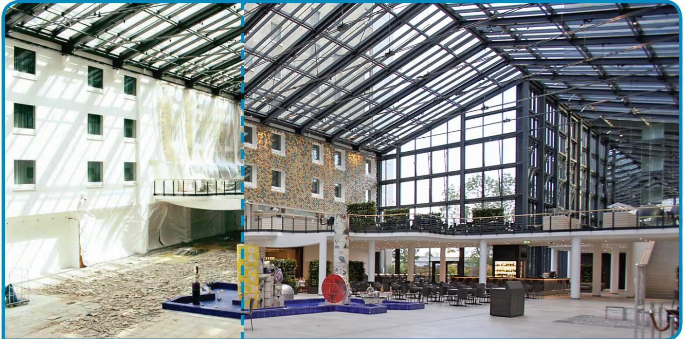
Before and after: The construction site picture that shocked some EF attendees versus the final result. What a difference a few weeks can make!

Estrel Berlin • Thursday, August 17 th 2017 • Issue 36