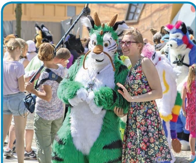
Parents, kids and TV crews flocked to see the fursuiters in the park.

Competition for "Flimmy" The Filmpark thus advertised the event publicly: "Meet the Furrries". It worked, as many families showed up to see the cuddly costumes, but also a crew from a national TV station. Was it a publicity stunt? Yes, but an enjoyable one, as the fursuiters enjoyed the interaction with the park visitors, making kids and parents smile. The park's own mascot "Flimmy", a walking film strip, was happy to share the spotlight. (lux)