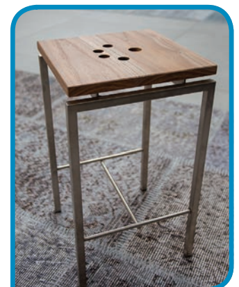
Despite looking like a tiny table, this pawprint-adorned furniture actually identifies as a chair. Sit!