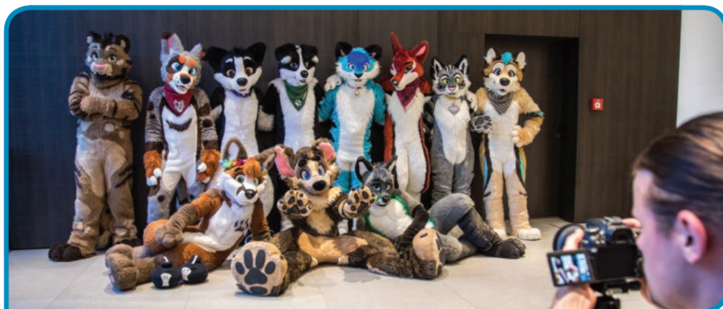
(Almost) all of this year's calendar models in one shot, with Tail operating the camera.